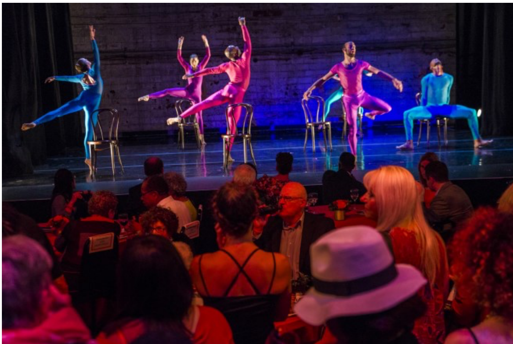
Pandemonium 2016: The Fire Within.

The Root Café, Saigon Food Service and Catering, West Side Market Café, and XYZ The Tavern.