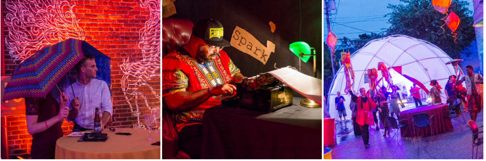
Pandemonium 2016: The Fire Within.