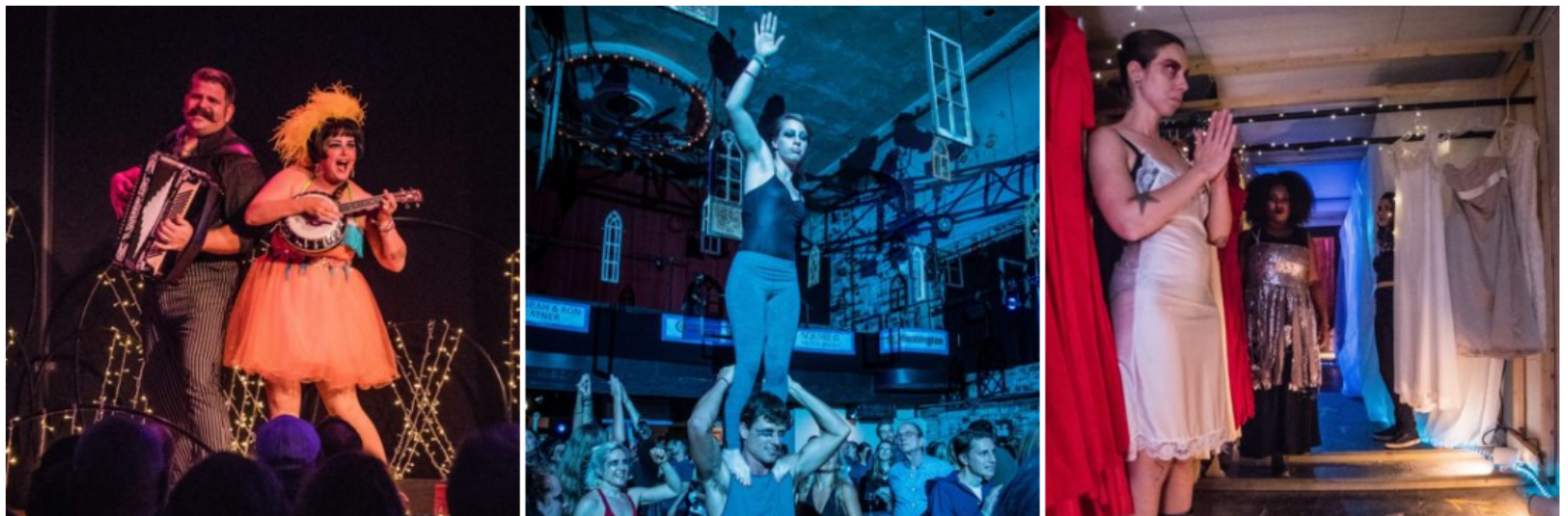
Pandemonium 2018: Labyrinth of Desire.