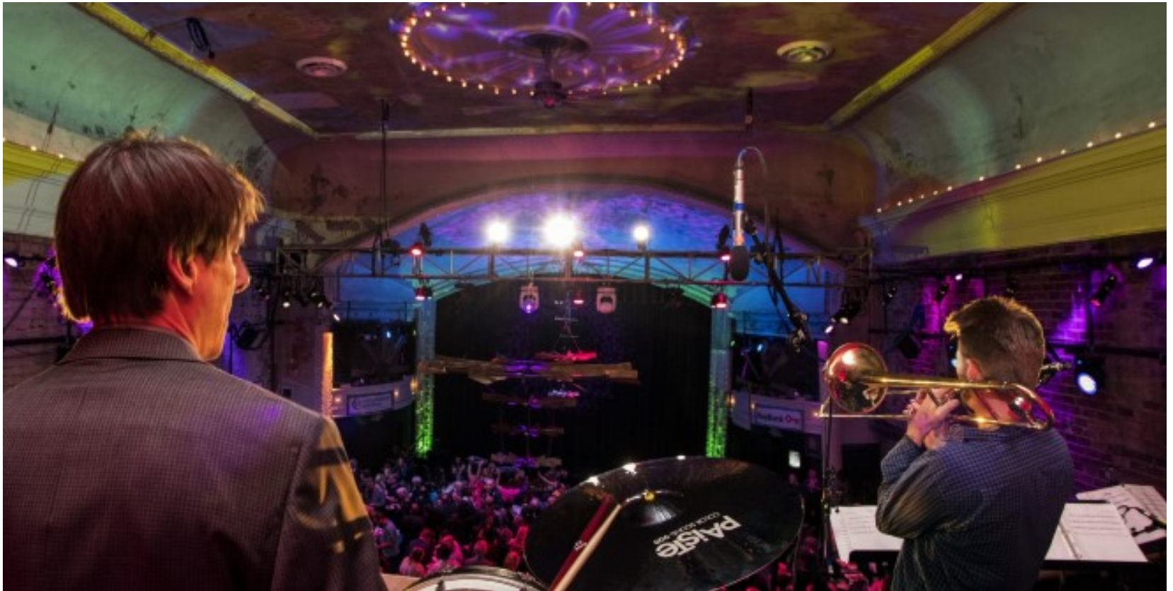
Pandemonium 2017: Unleash.

Having trouble viewing this email? Click here.