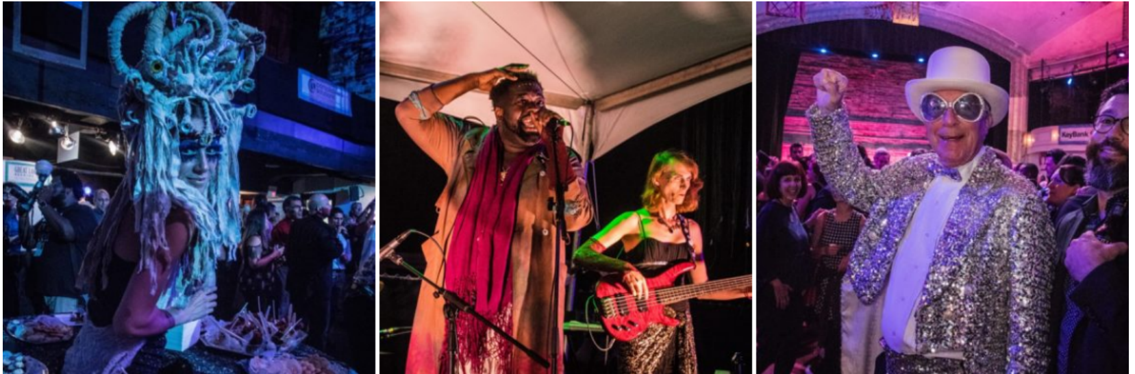
Pandemonium 2018: Labyrinth of Desire.